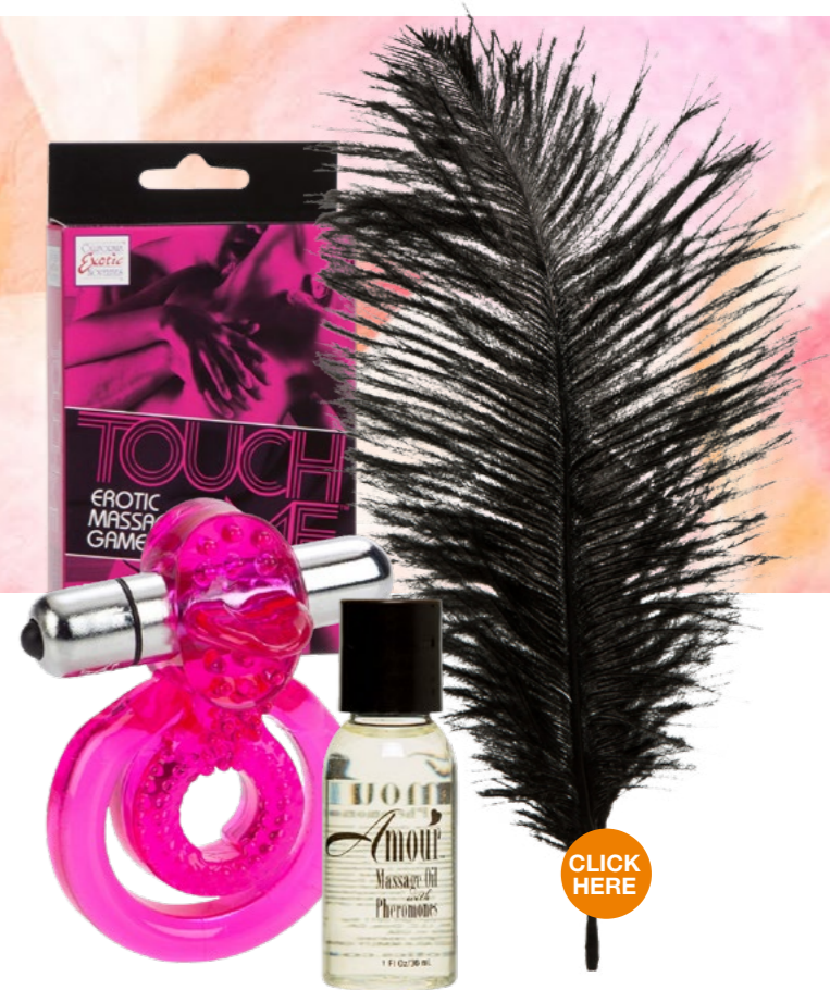
Date Night Kit 716770085146

Whichever gift-set you prefer, make sure to place your order soon to profit from the increased demand in gifting options this holiday season. Merry ordering!