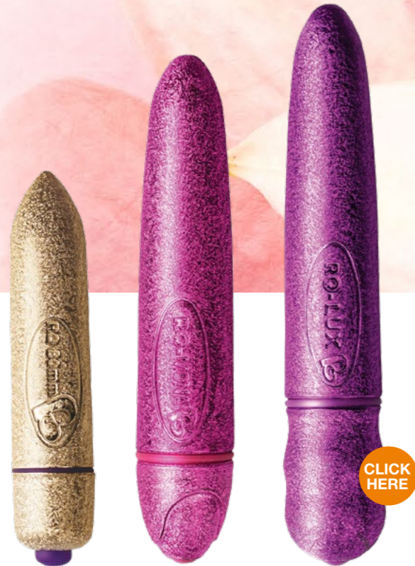
Glitter Glitz Bullet Set 81104101995