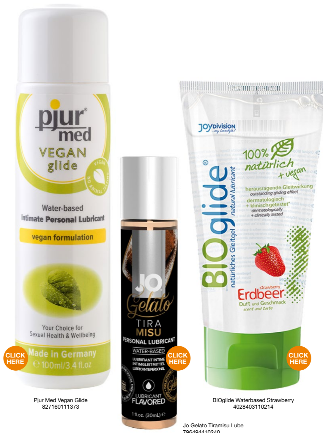
Pjur Med Vegan Glide 827160111373

So, what happens when things literally go sour? An unbalanced vaginal pH-value (anything outside the typical 3.5 to 4.5 range) can cause a number of problems and discomforts. The unbalance allows odor-causing micro-organisms and bacteria to flourish, leading to unwanted smells, pain or even infection. By maintaining a healthy pH-level, women can reduce the risk of vaginal issues and enjoy a worry-free, pleasurable love life.