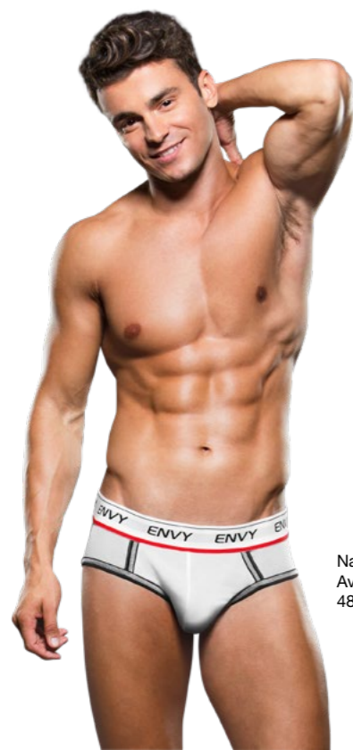
Name Available from S/M to L/XL 4890808164600