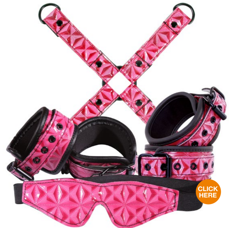
Bondage Kit 657447096587