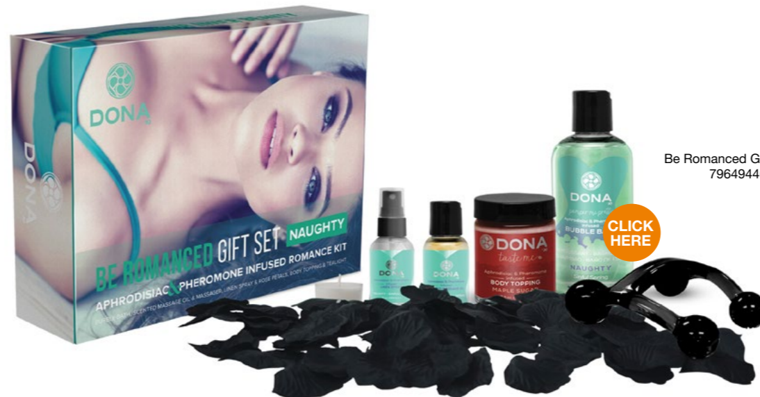
Be Romanced Giftset Naughty 796494406045