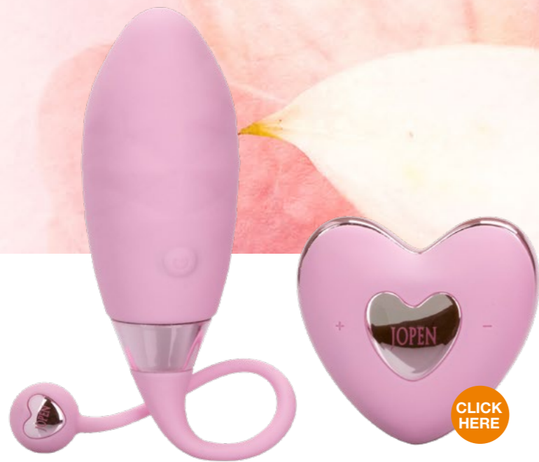
Silicone Remote Bullet 815768012802