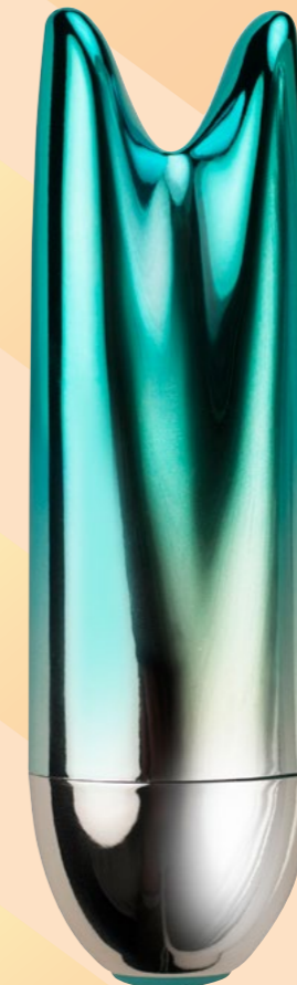
Atomic Teal 0811041013085