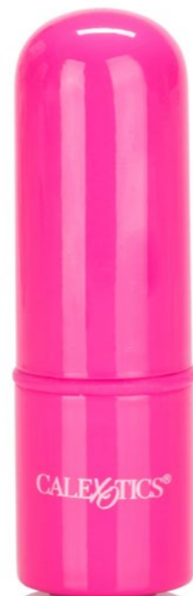
Mini Bullet 0716770089908