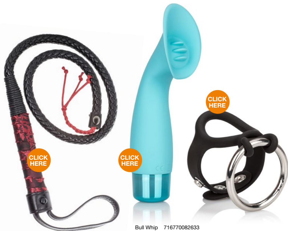
Bull Whip 716770082633 Climaxer 716770089731 Enhancer Set 716770089663

SCALA aims to bring you the newest, hottest and trendiest releases from your favorite brands, as soon as they hit the market. Our new warehouse in Wijchen, the Netherlands, ensures a better stock availability than ever before, with products instantly available for shipments via quick transport. The aim to be 'new' means we have lots of new, exciting arrivals in the upcoming weeks and months. This page provides a sneak preview of some of the stock arriving soon at SCALA.