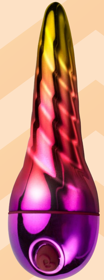
Unicorn Stardust 0811041013078