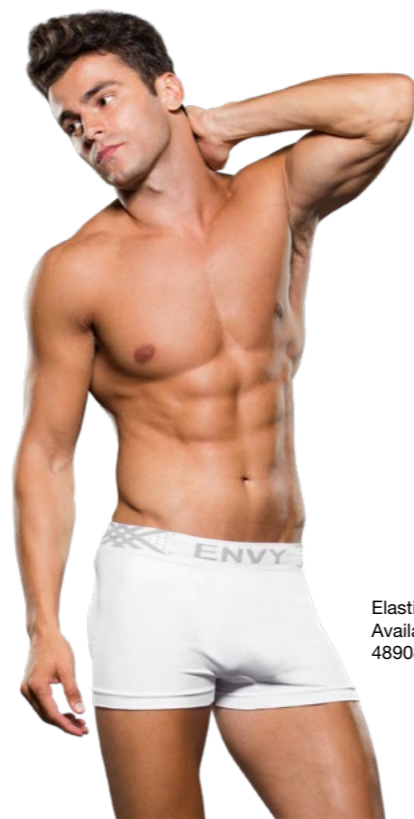
Elastic Seamless Boxer Available from S/M to L/XL 4890808165881

ENVY's male lingerie also offers a great selection of white-colored designs, perfect for everyday wear. These trendy basics are available in a great range of categories, including boxers, briefs and thongs. Made of quality materials such as soft cotton, sexy mesh and quality elastic, they offer a comfortable fit and enhance his masculinity in a fashionable, contour-flattering way. Explore all the neutral-colored designs and stock up today.