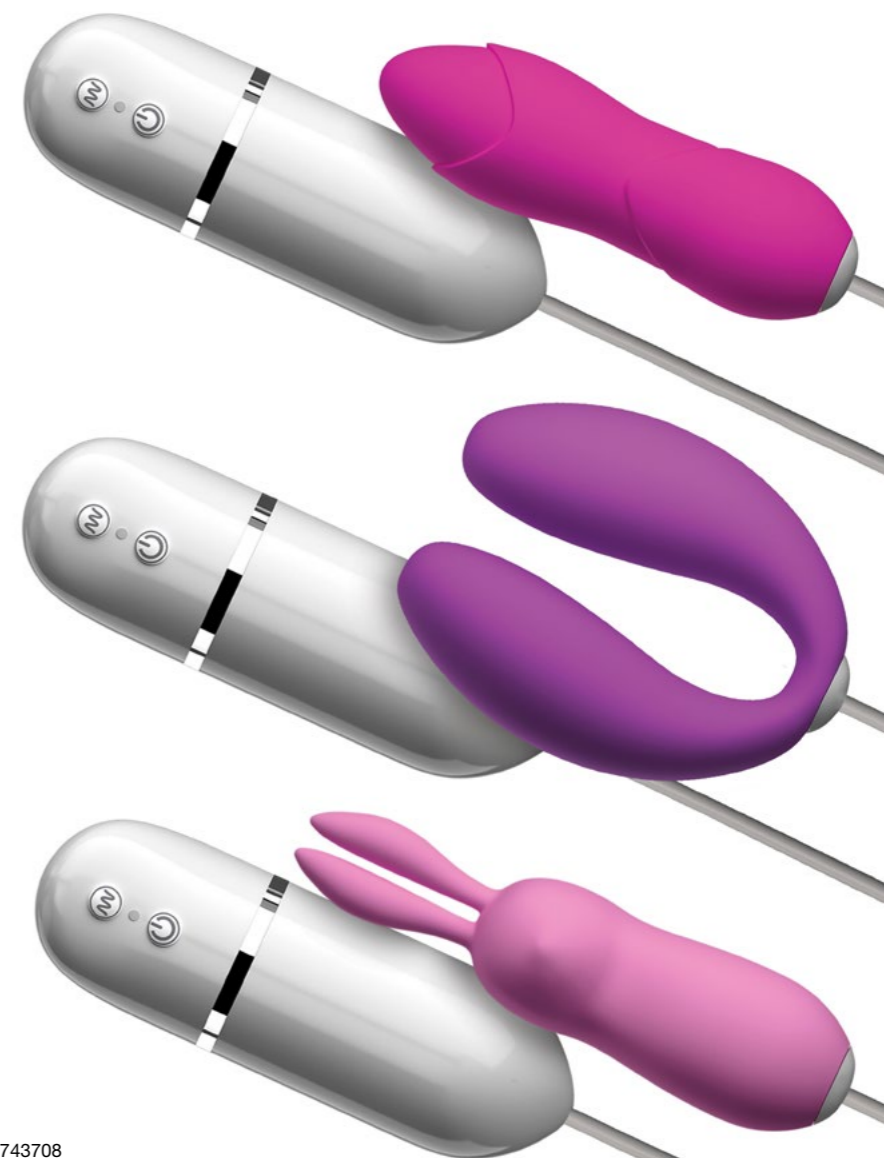
Crush Blossom 0603912743708 Crush Snuggles 0603912743678 Crush Precious 0603912743661