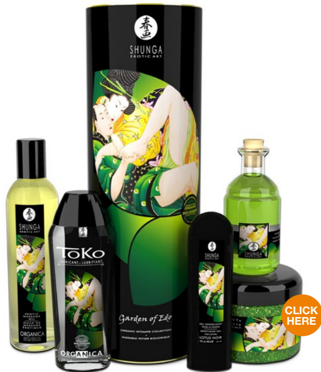
Garden Of Edo 697309090025